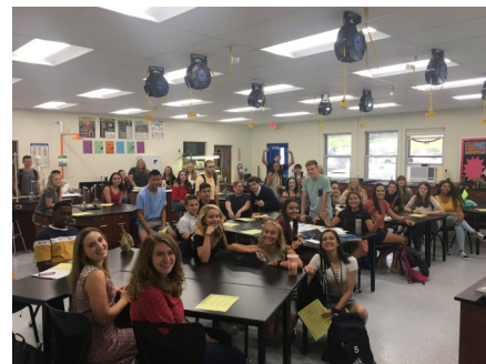
Students enjoying one of our newly renovated science labs.

Outside of the classroom we have some additional options for students who are passionate about science. Our Waksman Students Scholars Program is running once again this year. The program allows students to learn about genetics and partake in authentic research as they map the genome of Duckweed. Also, Science League (an academic science competition) will run once again with teams in all major areas (Biology, Chemistry, Physics, Environmental Science, Earth Science). Get involved Falcons!